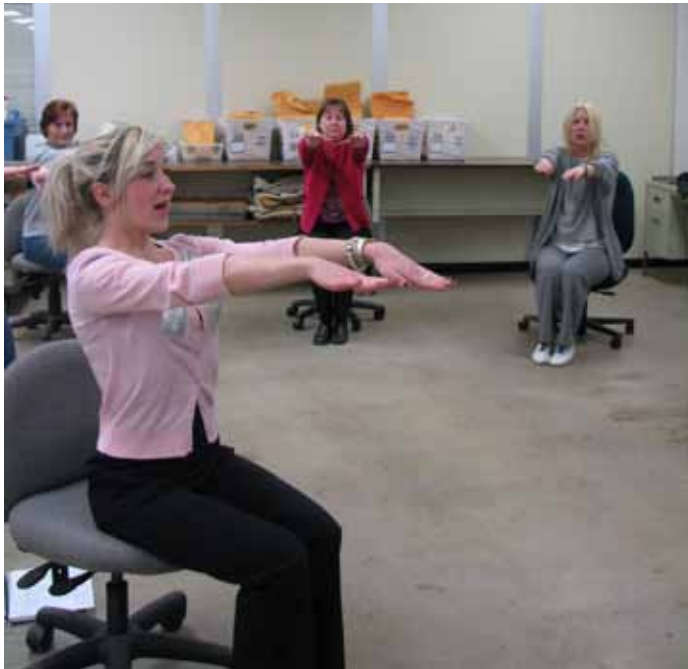
Sit and Be Fit

Thanks to all departments for being such great participants! For information, contact ESHRD at 815-753-1690 or go to www.niu.edu/eshrd .